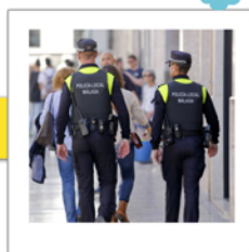
POLICE OFFICERS INTERVIEWS